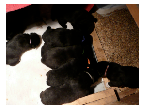
There is a food bowl in there.