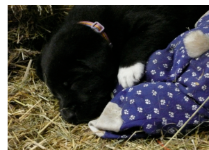
Nap time. Always!